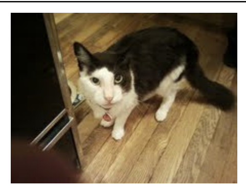
Pretty Boy McTavish

BY MAIL: CHECKS can be sent to Spay and Neuter Solutions, P.O.Box 762, Cortaro, AZ 85652